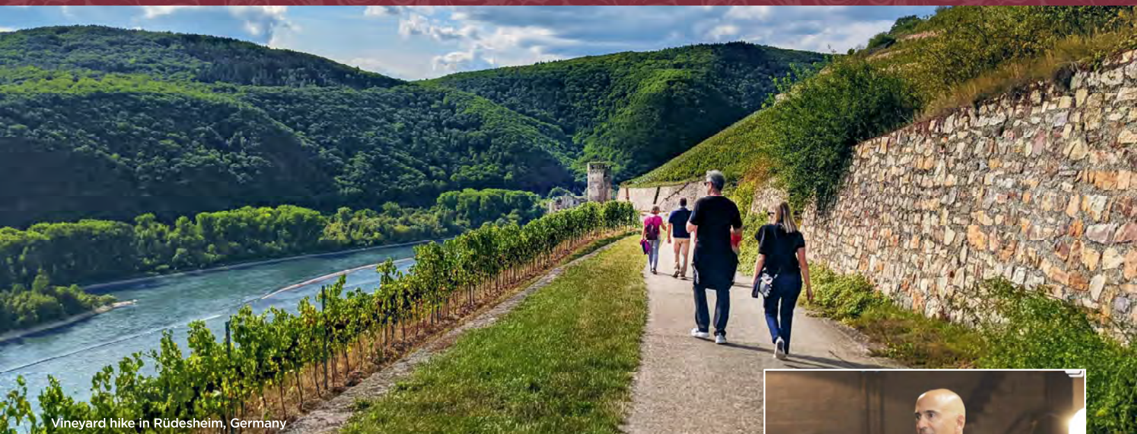
Vineyard hike in Rüdesheim, Germany

Uncork local traditions, savor intense flavors and enjoy palate-pleasing adventures during an AmaWaterways Wine Cruise